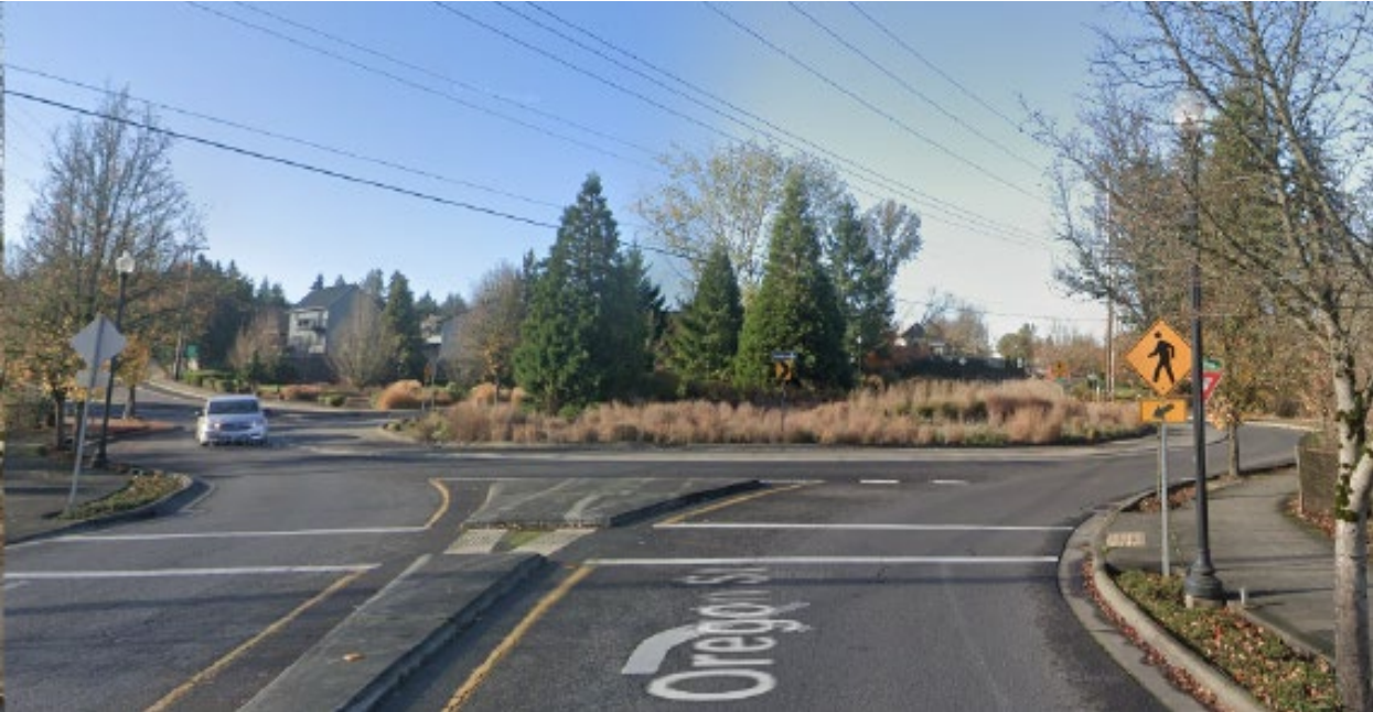
Oregon Street Facing Southwest