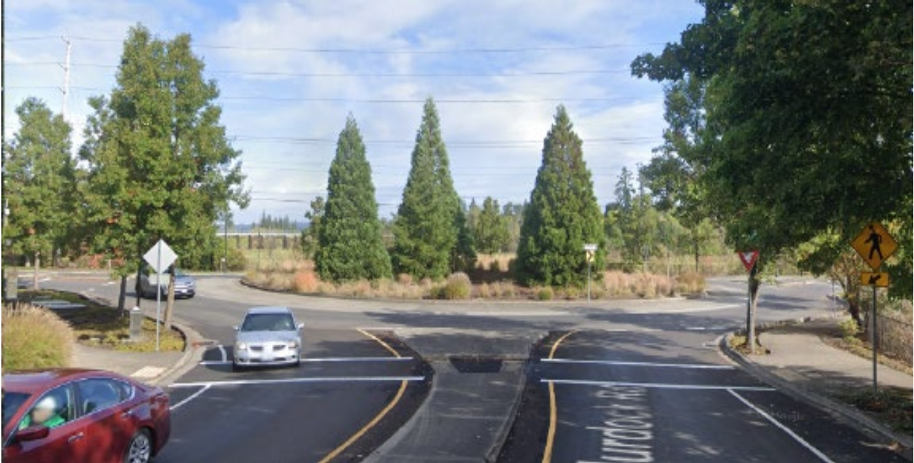
Murdock Street Facing North