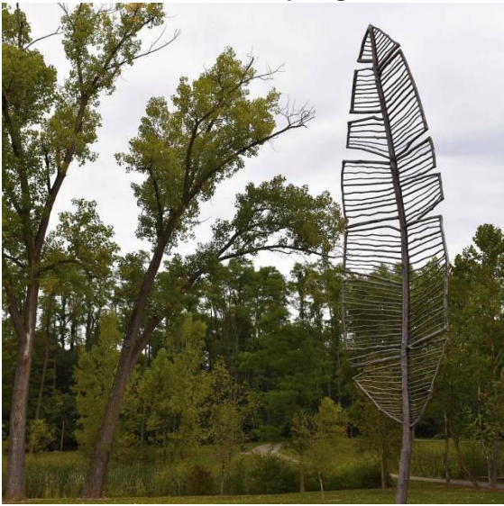
Dublin, Feather Point by Olga Ziemska

If Sherwood needs one iconic subject to represent, a feather would be a good choice to consider.