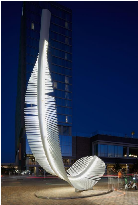
lighting Public Art Projects | City of OKC

If Sherwood needs one iconic subject to represent, a feather would be a good choice to consider.