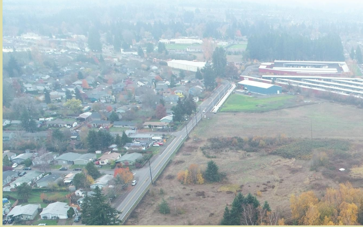
Tannery Cleanup Site Area

This is part of a broader vision to ensure that Sherwood remains a desirable place to live and thrives as a forward-thinking, sustainable community. Our focus on reclaiming and effectively utilizing our tax dollars for the community's benefit is a testament to our commitment to enhancing Sherwood's livability for today and future generations.